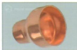
Copper Reducing Coupling