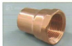
Copper Female Adaptor