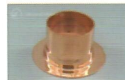
Copper Inner Flange