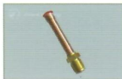
Copper ACR Connect Pipe