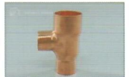
Copper Reducing Tee