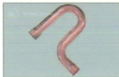
Copper P Trap