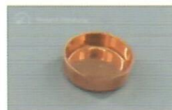
Copper End Cap