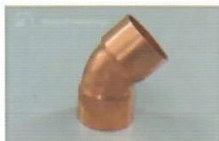
Copper 45Deg Elbow