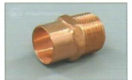
Copper Male Adaptor