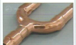
ACR Branch Joint