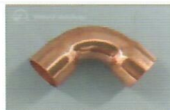
Copper 90Deg Elbow LR