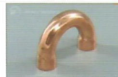
Copper U Bend