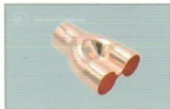
Copper Pant Tee