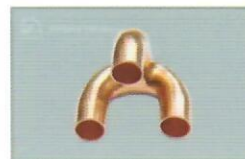
Copper Shaped Tee