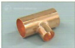
Copper Reducing Tee