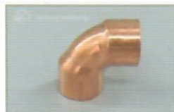
Copper 90Deg Elbow SR