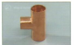
Copper Equal Tee