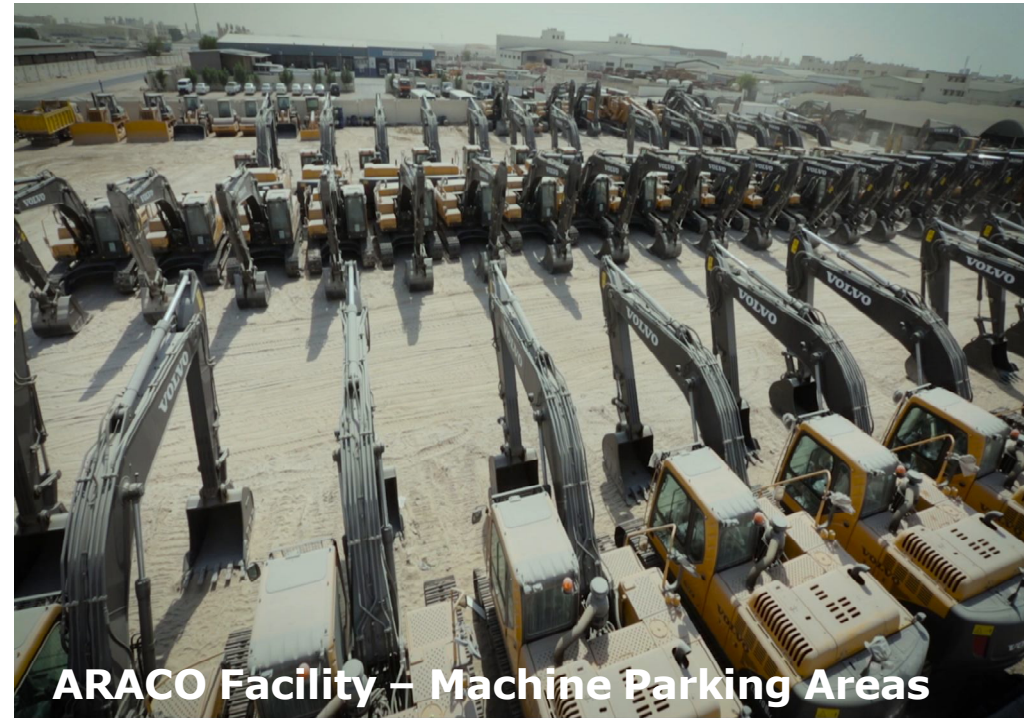
ARACO Facility – Machine Parking Areas