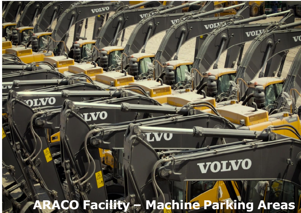
ARACO Facility – Machine Parking Areas