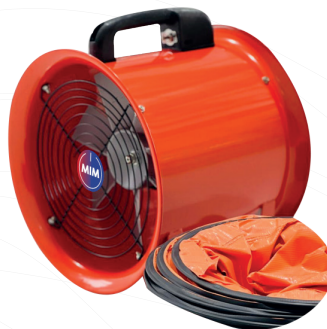
Portable Axial Ventilation Fan & Flexible Duct