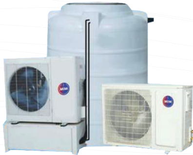
Roof Top WaterTank Chiller ( MIM Made In India) (Piston Compressor)