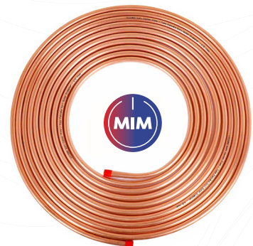
Copper Pan Cake Coil