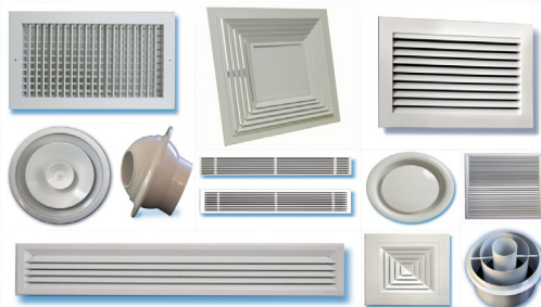
Diffusers and Grills