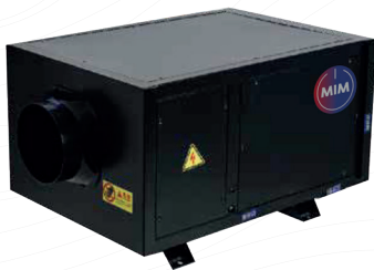
Dehumidifier Ceiling Concealed for Swimming Pools