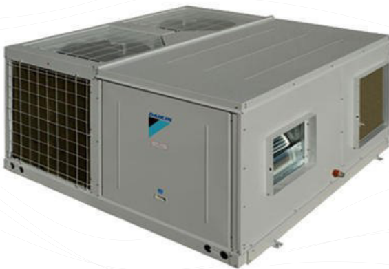
Roof Top Package Unit