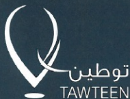
Saad Sherida Al-Kaabi

Minister of State for Energy Affairs President & CEO