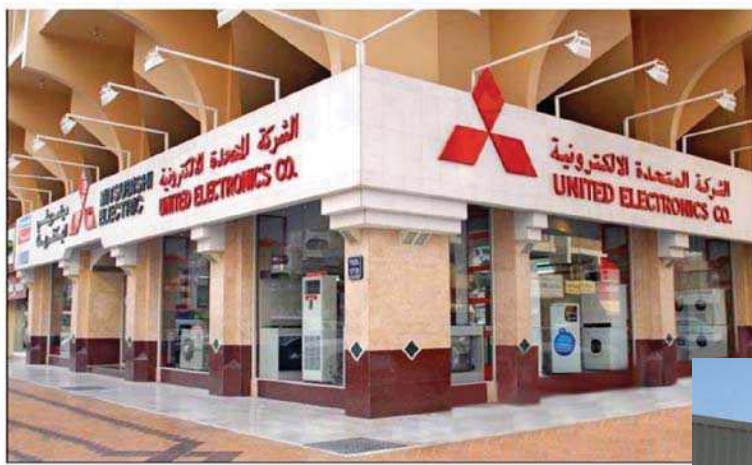
Head Office & Show Room Hamdan St.

E-mail : unitco@emirates.net.ae, salesauh@unitco.ae