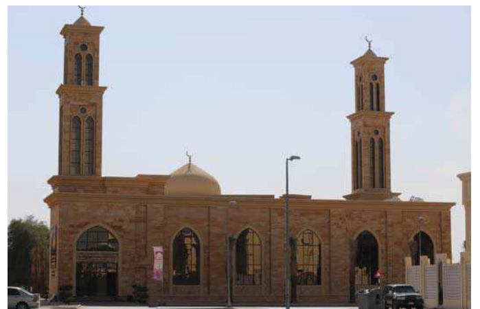
Mosque - Al Ain