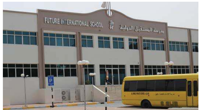
Private School-Al Ain