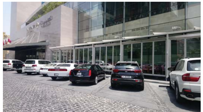
Orangery Restaurant La Sigal Hotel - Qatar