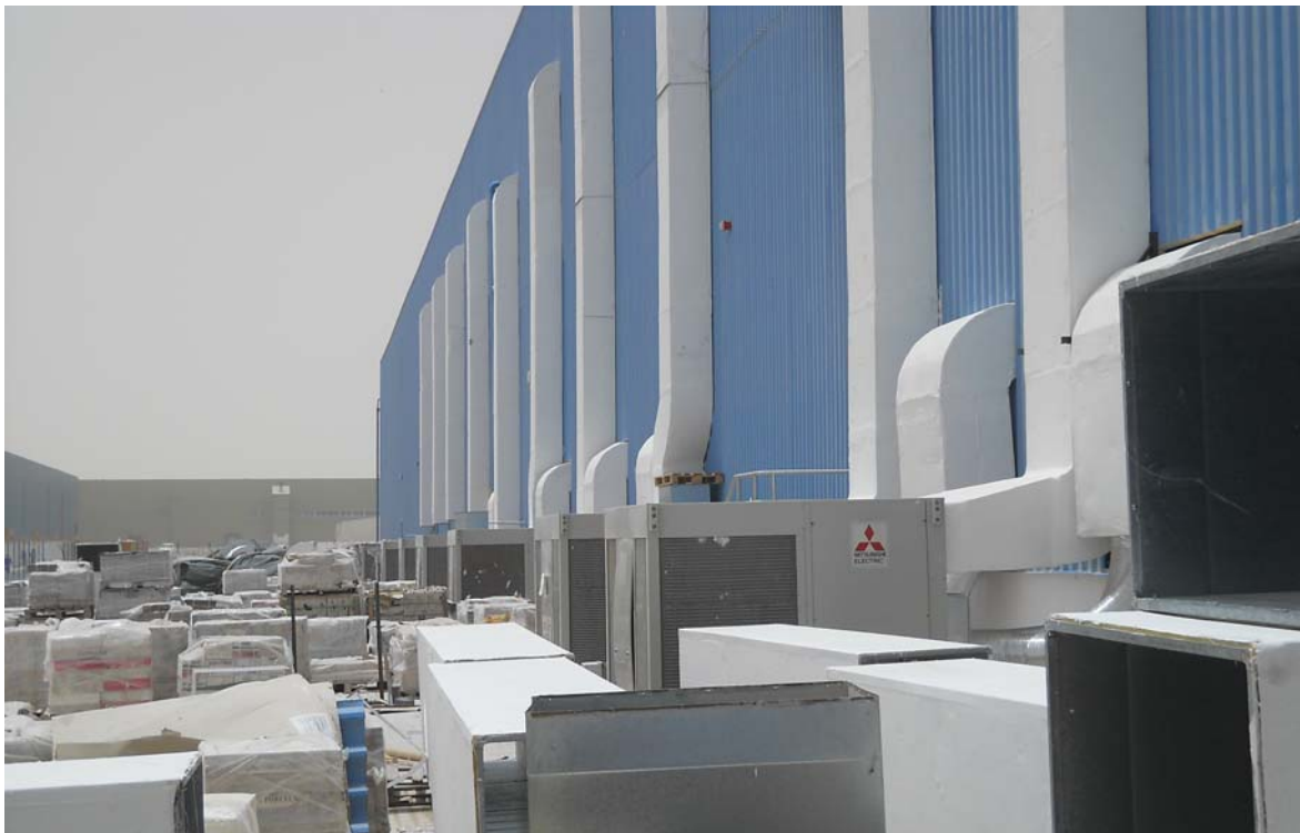
Warehouse Industrial Area - Qatar