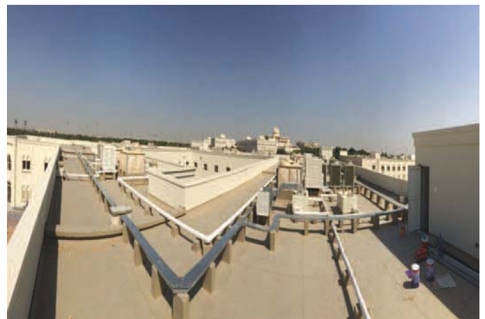
American University - Dubai