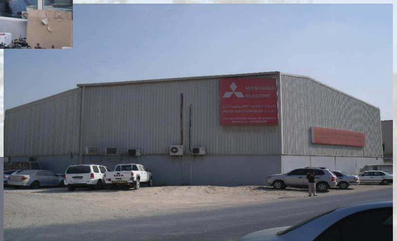
Store - Al Qusais Industrial No. 4, (6500 Sq. Mtr.)