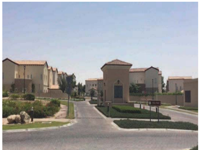
173 villas Jumeirah gulf state - Dubai