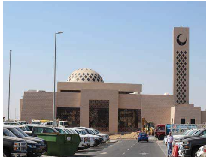
Mosque - Al Ain