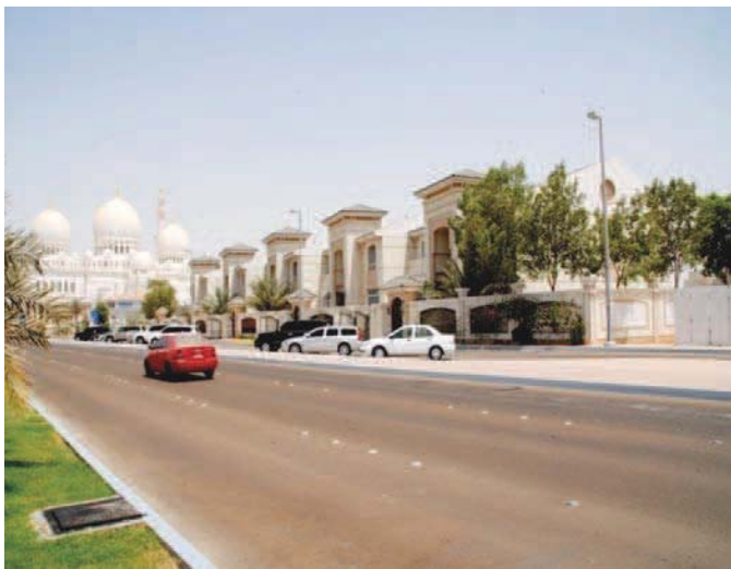
5 Typical Villas - Abu Dhabi