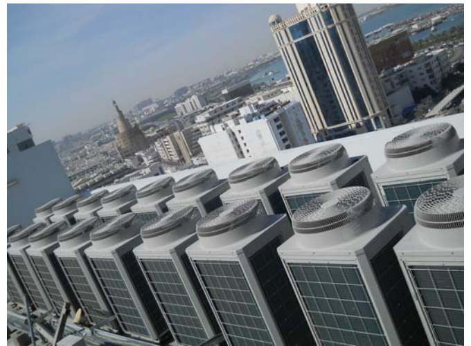
Office Buildings - Qatar