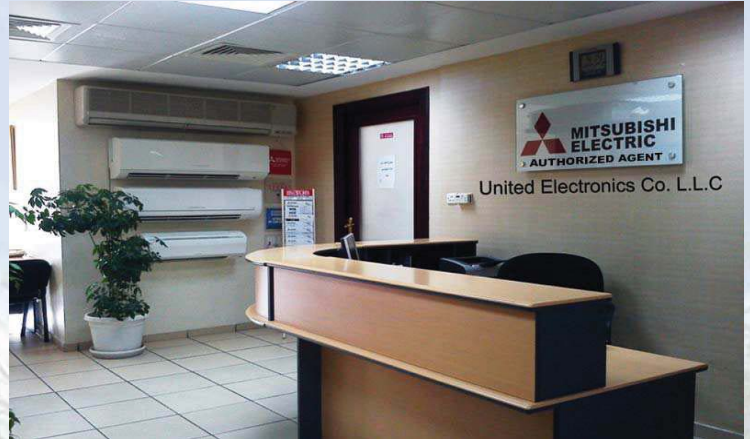
Show Room - Al Ain Mall