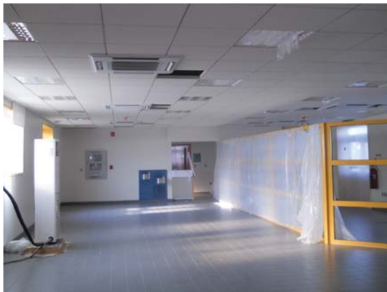
New Doha International Airport - Qatar