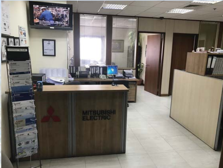
Branch Office - Qatar

The United Electronics Company expanded to Qatar branch office in 2006 Address: Mushaireb Area, Al Diwan St., Doha Bank Building, Office No. 304 P.O. Box 37945, Doha, Qatar Tel. No.: (974) 4437-0011 / 4437-6424 Fax No.: (974) 4437-6385 Email : unitcoqatar@unitco.com.qa