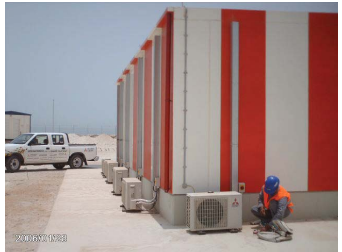
Doha International Airport - Qatar