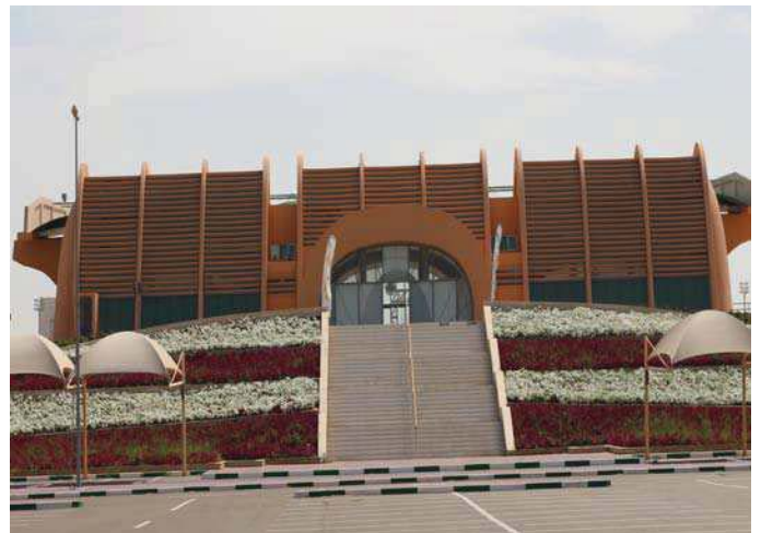
Equestrian Club - Al Ain