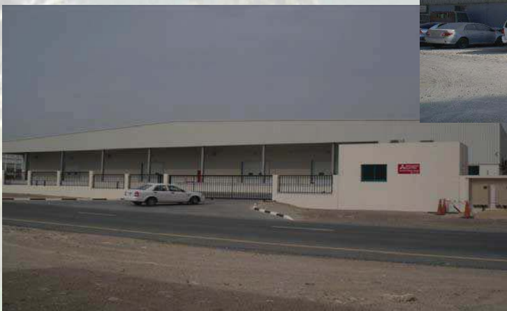
Store - Jabel Ali, Jafza (10,800 Sq. Mtr.)