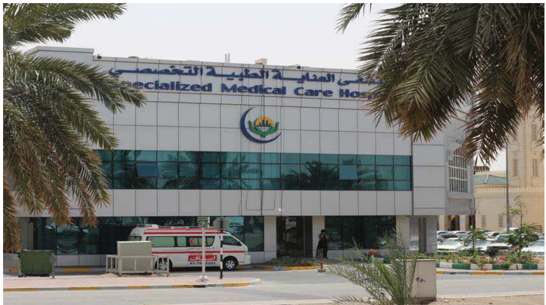
Private Hospital Al Ain