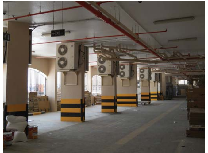
Residential Building - Airport Road, Qatar