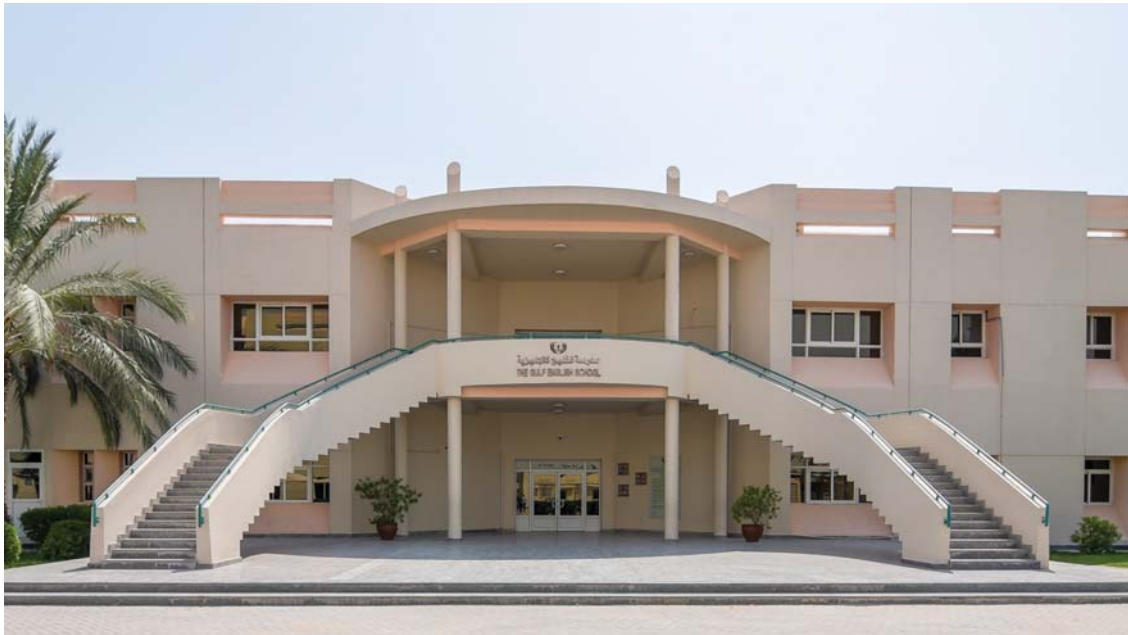
Gulf English School - Qatar