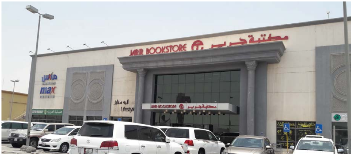
Jarir Bookstore Al Rayyan - Qatar