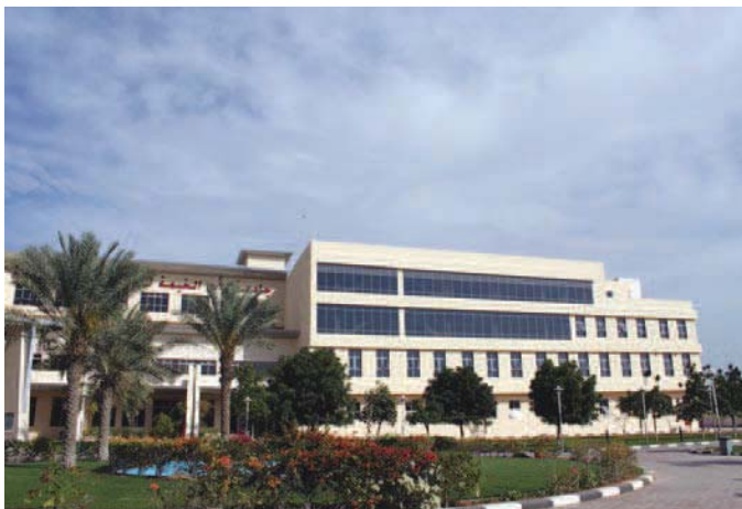
Medical Health University - Ras Al Khaimah