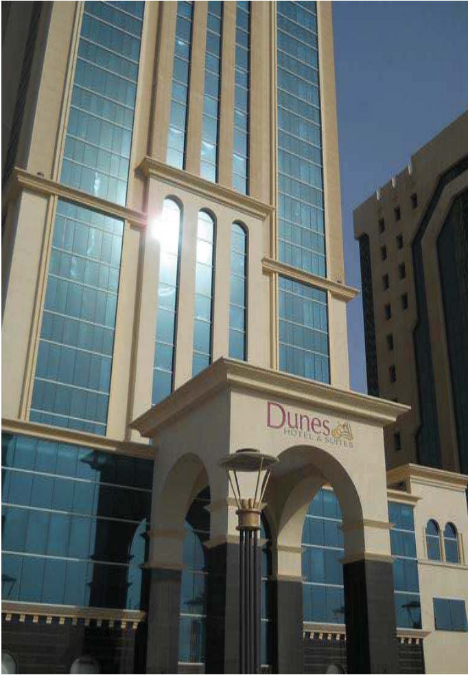
Dune Hotel - Qatar