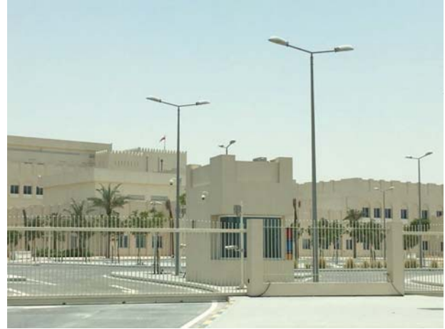
Workers Hospital Mesaieed - Qatar