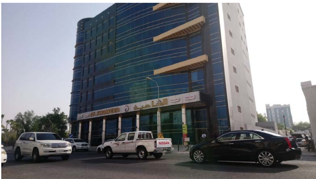
Jaffco Building - Al Muntazah, Qatar