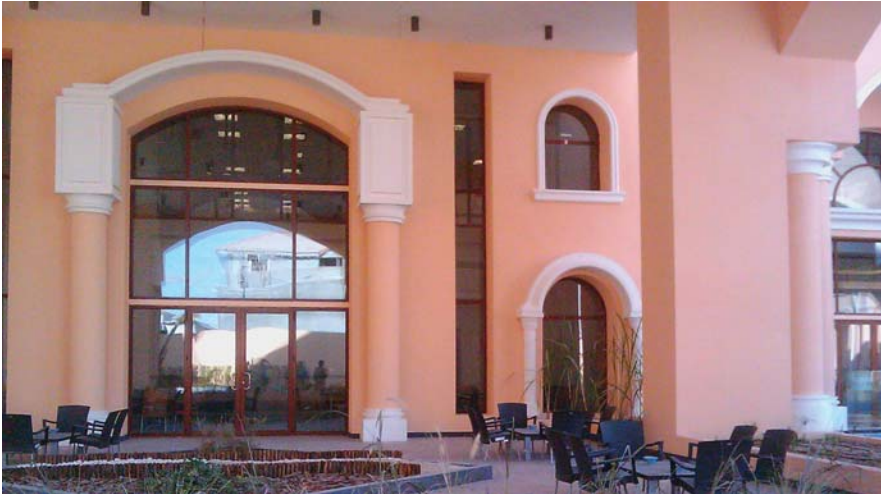
Al Rayan Club House - Doha Qatar