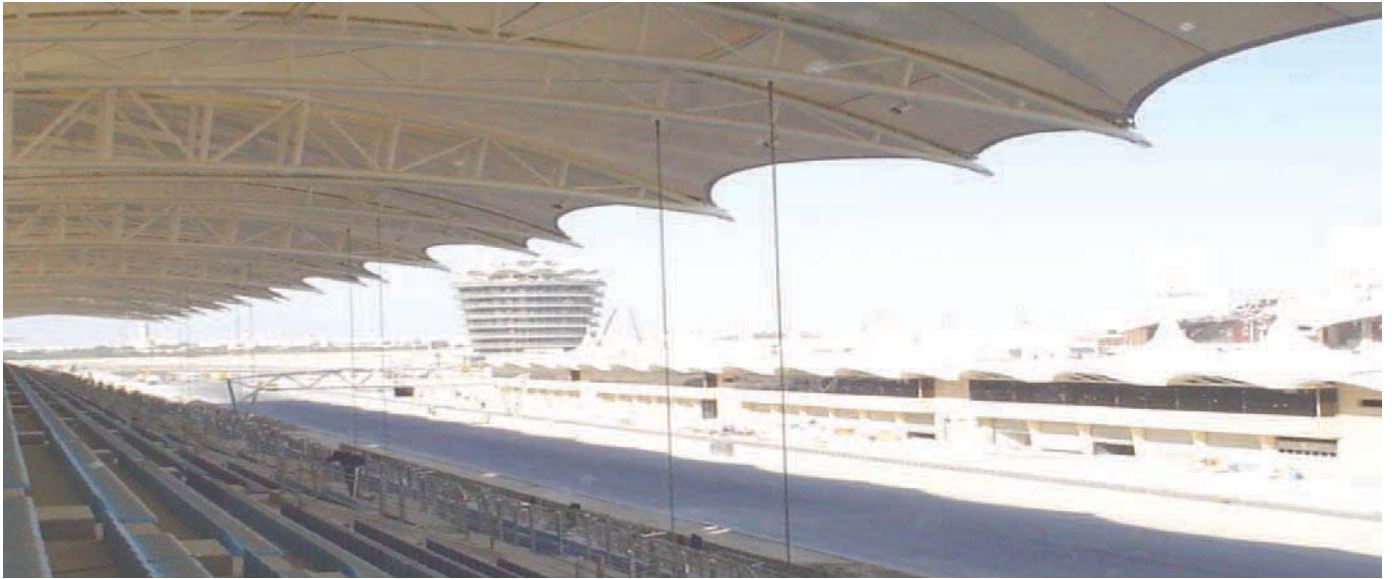
Formula 1 Track - Bahrain