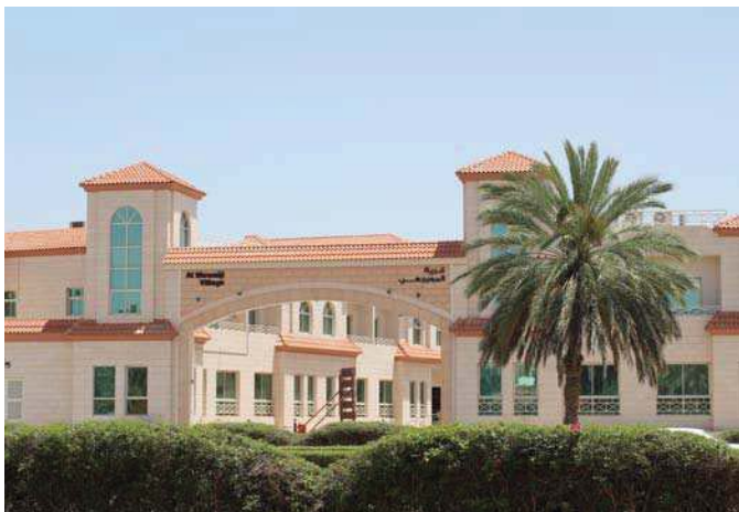
Al Muwaiji Village - Al Ain