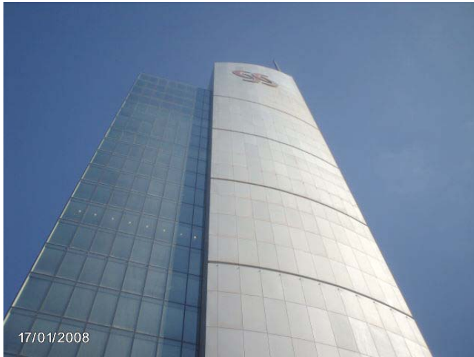
Commercial Bank of Qatar - Al Dafna