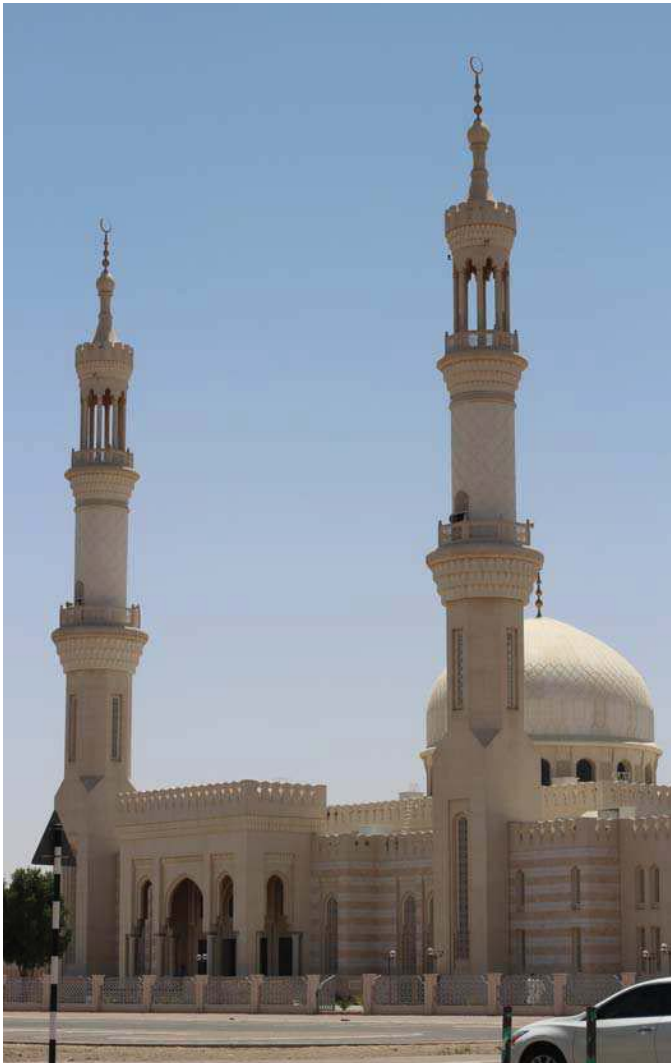
Mosque - Al Ain