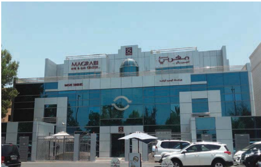
Al Magrabi Eye & Ear Center Abu Dhabi