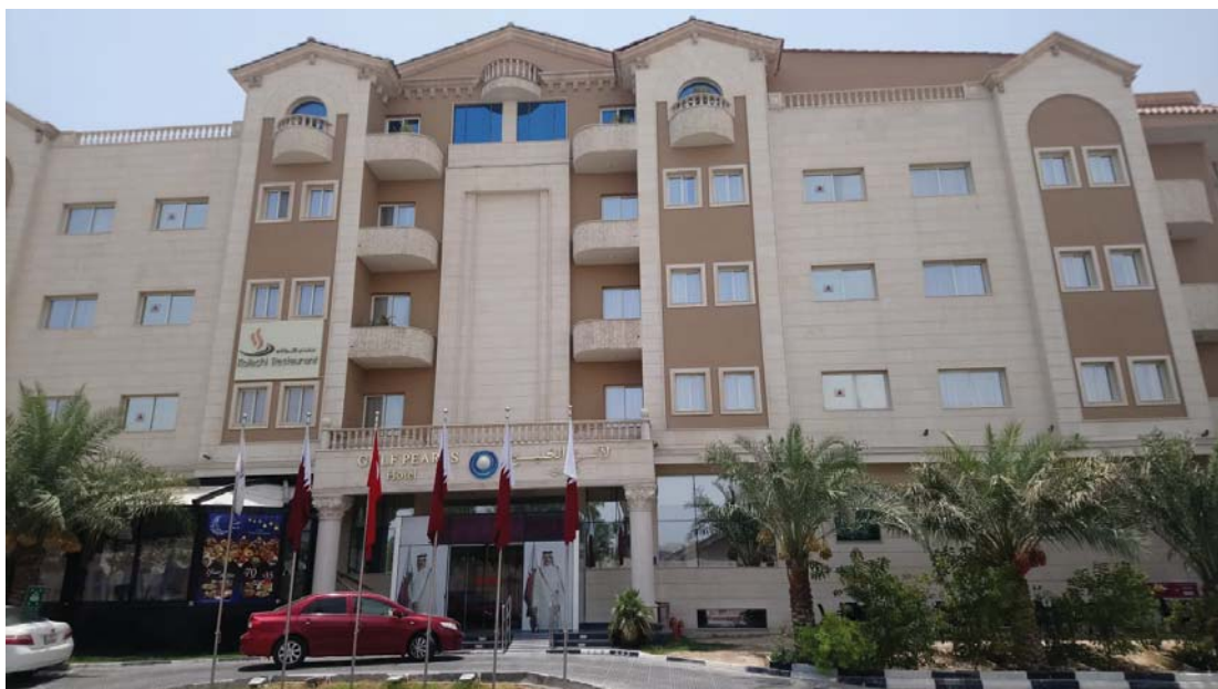
Gulf Pearls Hotel - Qatar