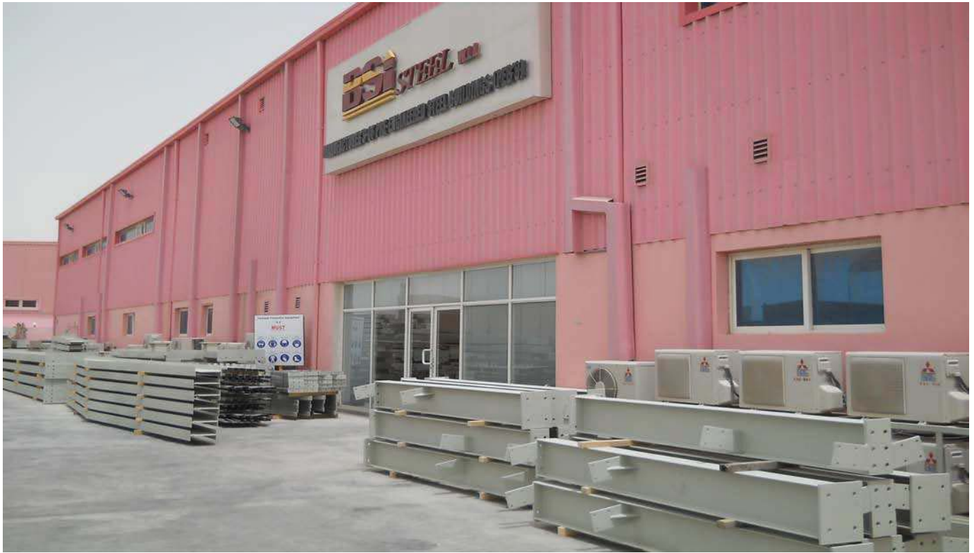
Industrial Office - Qatar