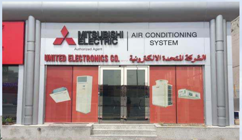
Head Office & Show Room Al Garhoud - AirPort Rd.