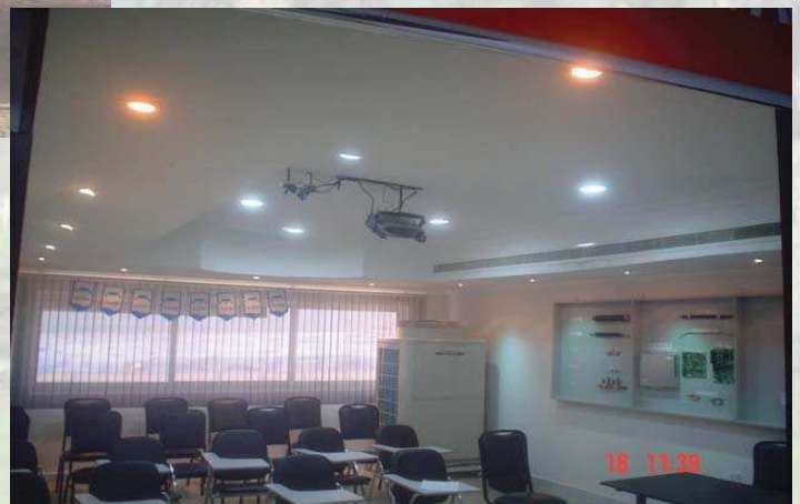
Training Centre - Mina Zayed