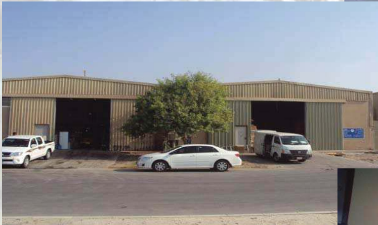
Workshop - Mina Zayed (385 Sqr. Mtr.)