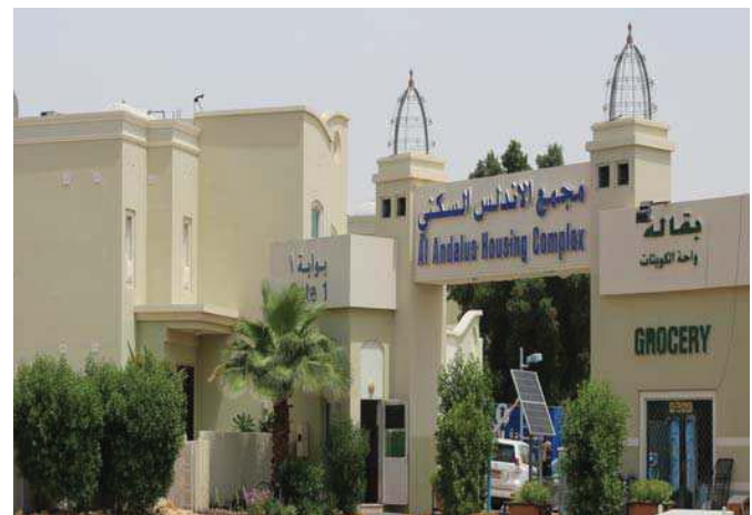
Housing Complex - Al Ain