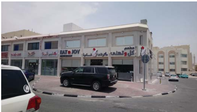
Eat n Joy Restaurant Al Nasr - Qatar