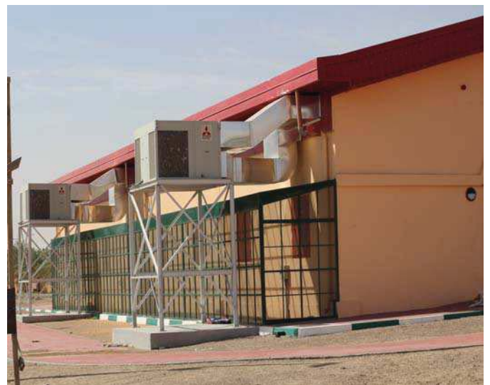
Stables in a Sports Club - Al Ain