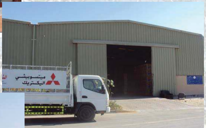
Store - Mina Zayed(3600 Sqr. Mtr.)