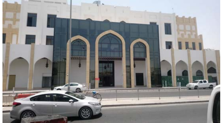
Souq Najada Hotel - Qatar