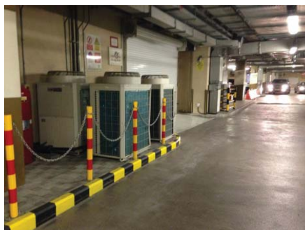
Souq Waqif Parking - Qatar