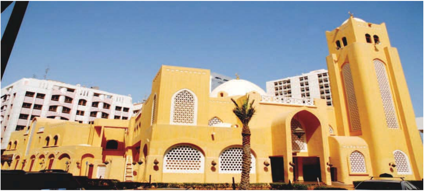
Mosque in Khalidiya - Abu Dhabi