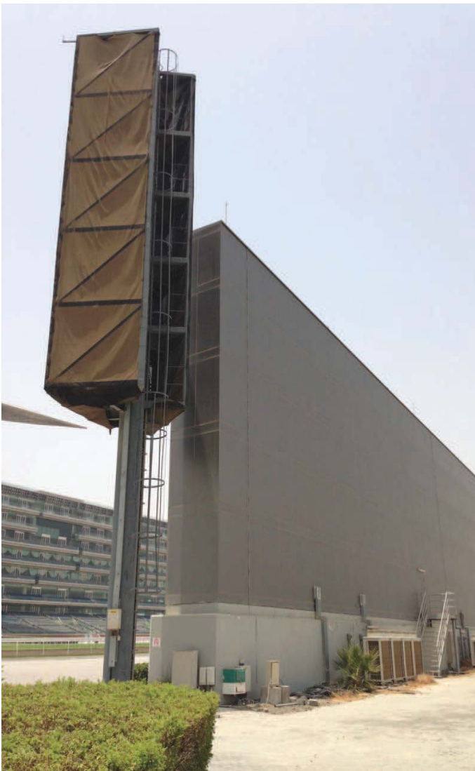
LED Screen - Dubai