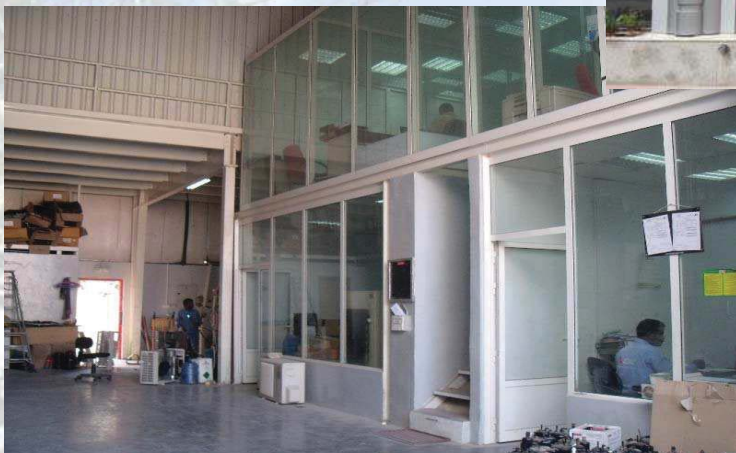
Workshop - Al Qusais Industrial No. 4