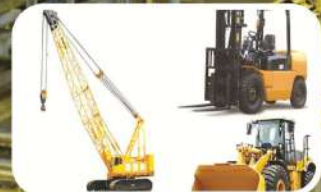
LIFTING TOOLS & HEAVY EQUIPMENT INSPECTION