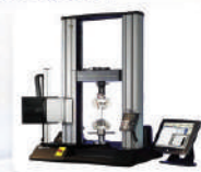
Tensile & Compression