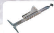
Hi Low Gauge