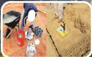
SOIL, CONCRETE, ASPHALT, COMPACTION, AGGREGATE & CEMENT TESTING GEO TECHNICAL SERVICES