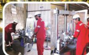
VALVE TESTING, REPAIRING & OVERHAULING SERVICES

"YOUR SUCCESS IS OUR GOAL & QUALITY IS OUR MOTTO"