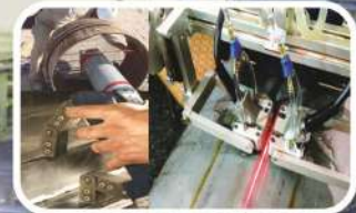
NDT & ADVANCED NDT SERVICES