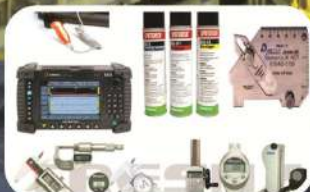
INSPECTION TOOLS & TRADING