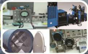
ALL TYPE OF INSTRUMENT & EQUIPMENT CALIBRATION