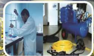
CHEMICAL ANALYSIS OF WATER & AIR QUALITY TESTING SERVICES