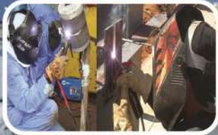
QUALIFICATION OF WELDING PROCEDURE & WELDER QUALIFICATION

An ISO 9001:2015 & OHSAS 18001:2007 Certified Company