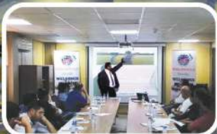
TRAINING-AWS, TWI, NDT, ISO, Etc...