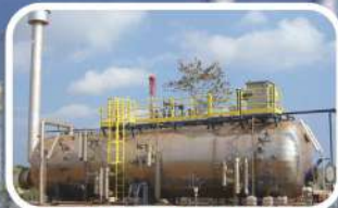
THIRD PARTY & VENDOR INSPECTION